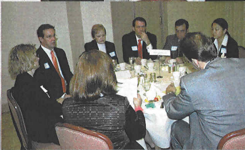
Photos from the January HBA Gender Initiative Breakfast